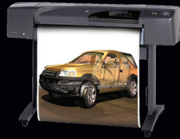
HP Designjet 800 Printer series